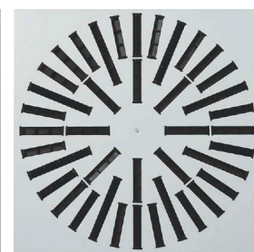
1. Epoxy-painted perforated grid